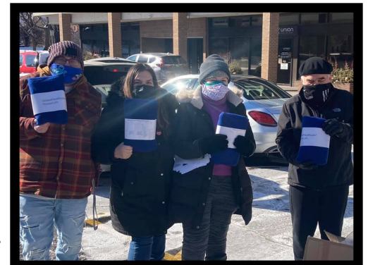
Our Local Community Solidarity Committee delivered 100 thermal blankets to homeless encampments in Minneapolis