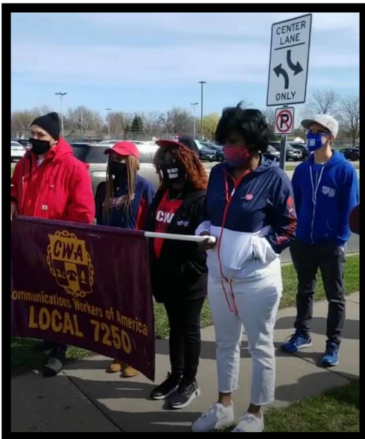
Labor Press Conference for Justice for Daunte Wright, Brooklyn Center