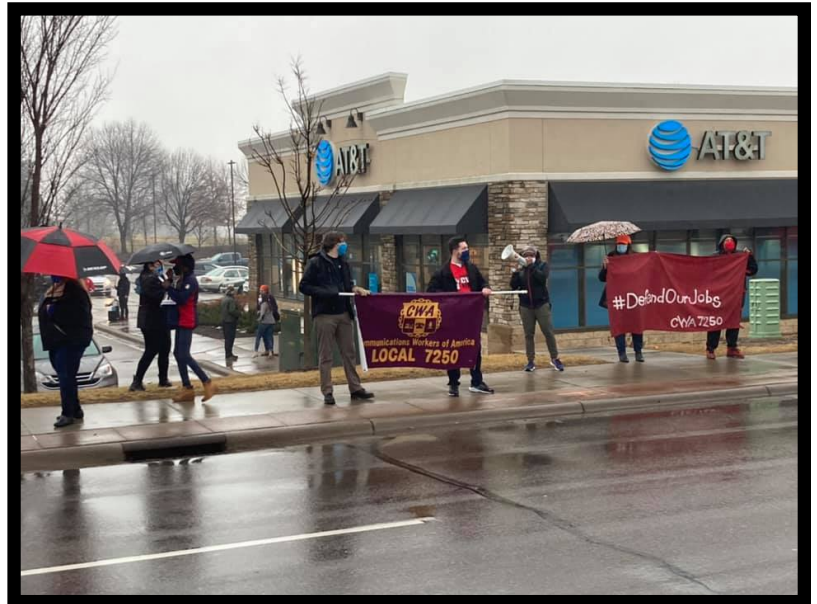
Picketing Against AT&T's union busting in West St. Paul