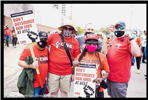
May 1st International Workers' Day March Lake St. in south Minneapolis