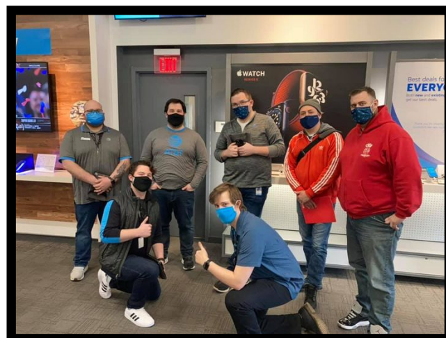
Visiting Members & recruiting Stewards in St. Cloud MN