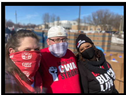
Delivering free groceries with other unions in north Mpls